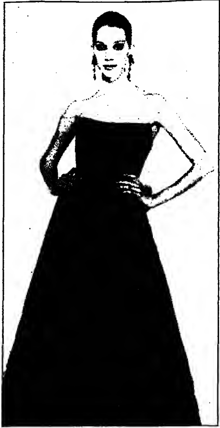
Oberson's spring/summer collection

sequined zigzag bodice topped by a square-shouldered, shawl-collared bolero.